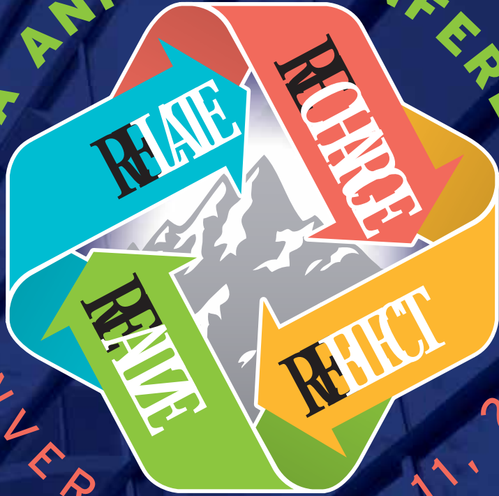
EXHIBIT • SPONSOR • ADVERTISE